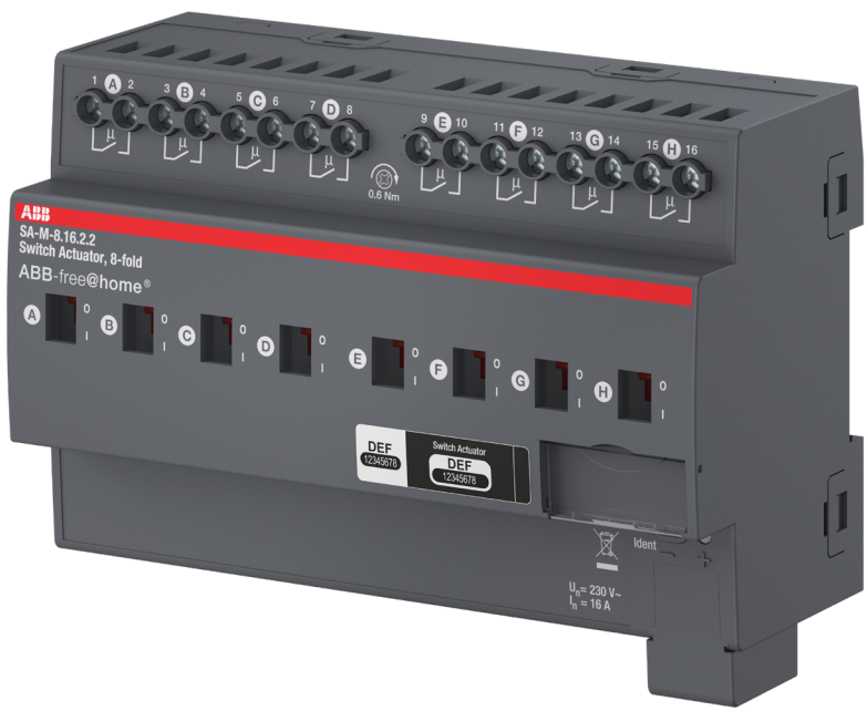
ABB Eco Solutions™

ABB-free@home® Switch Actuators enable the reliable switching and controlling of different electrical loads in the free@home® system. Each contact has a manual operation function independent of auxiliary voltage for additionally displaying the contact setting.