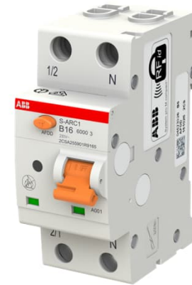
ABB Eco Solutions™

S-ARC1 provide maximum safety in all buildings, thus protecting people and valuable assets. By early detecting arc faults and disconnecting the affected circuit they offer reliable and complete protection in any type of building.