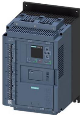
SIRIUS soft starter 200-690 V 25 A, 110-250 V AC Screw terminals

product brand name product category product designation product type designation manufacturer's article number