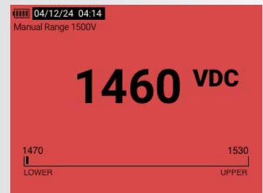
Limit gauge – outside of range