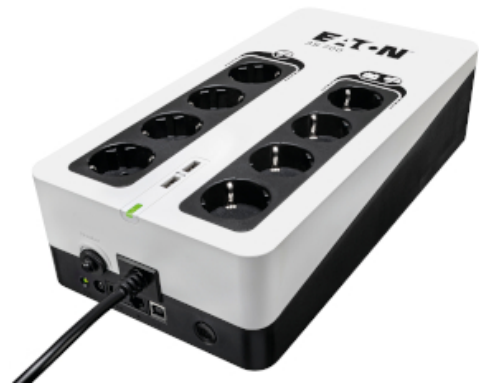
Figure 1 Eaton 3S 850 FR

Functional unit: To protect the load of 510 Watts against input power failure during 5 years and switch to the energy storage system to avoid power outage.