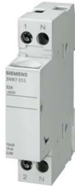
SENTRON, cylindrical fuse holder, 10x38 mm, 1P+N, In: 32 A, Un AC: 690 V