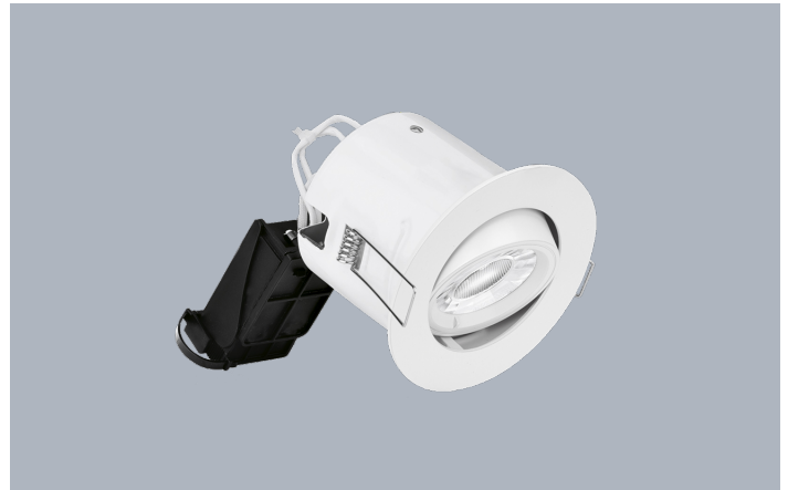
EFD™ PRO Adjustable Professional Fire Rated Downlight