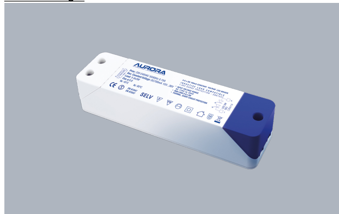
25W Non-Dimmable 12V Constant Voltage Driver