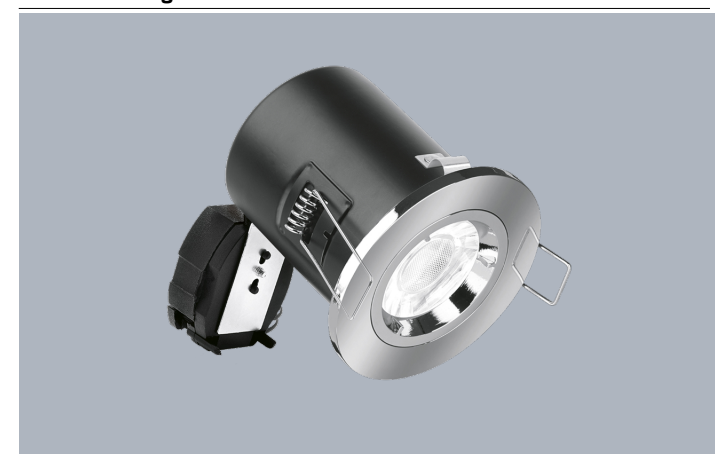
EFD™ GU10 Fixed Lock Ring Aluminium Fire Rated Downlight