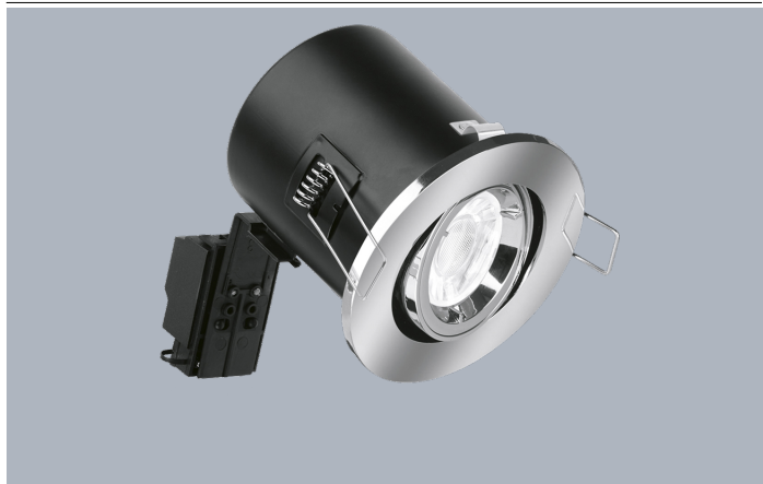
EFD™ GU10 Adjustable Lock Ring Aluminium Fire Rated Downlight