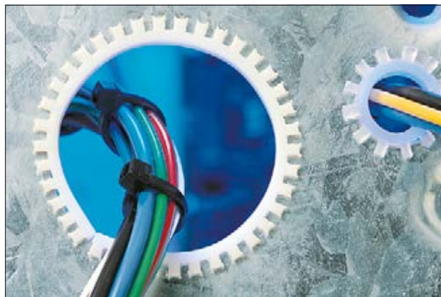
Optimal protection of cables and wires at panel edges.