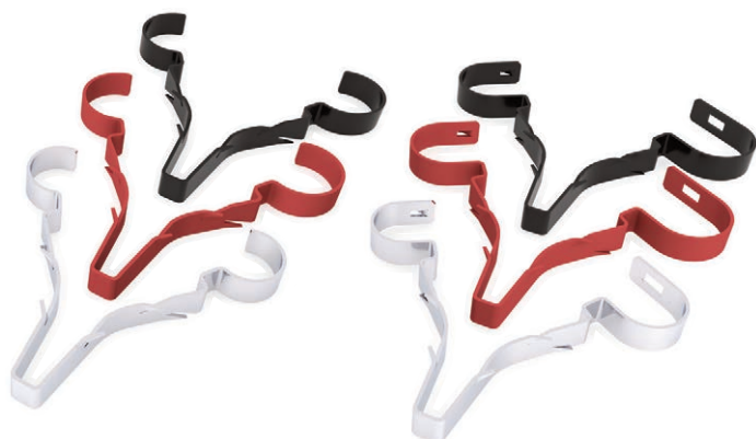
For 1x cable options 6-8mm & 8-10mm