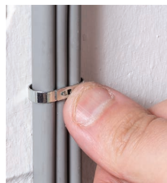
Push home to secure the Stag Clip and cable(s)

Safe-D Stag Clips can be first-fixed with their lower barbs gripping in pilot-holes, ready for second-fix cabling works.