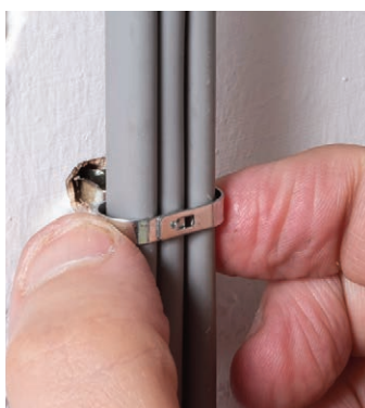
Insert cable(s) before squeezing the smooth head