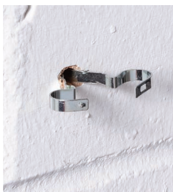
Rest Stag Clip in the pilot hole ready to accept cable(s)