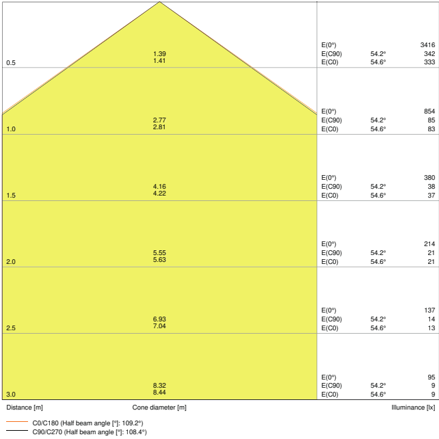
LDC typ cone