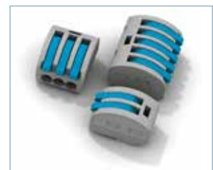
SBOX 2, SBOX 3 and SBOX 5