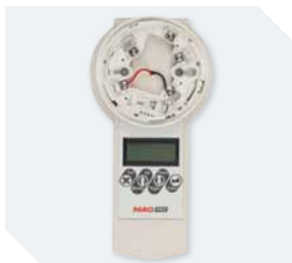
MAGPRO-PROG PROGRAMMING TOOL

For reading/writing addresses to Callpoints, detectors, sounders and modules.