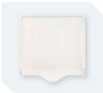
MAGPRO-CPC Plastic Cover for MAGPRO-CP (Pack of 5)