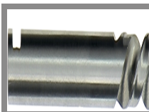
Hss pilot drill for Clic II hole saw 120 mm