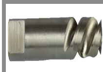
HSS pilot drill for BIZ 700 896 and BIZ 700 897 arbors