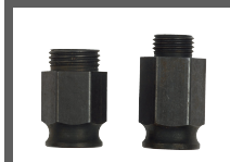
SET OF TWO CLIC ADAPTERS