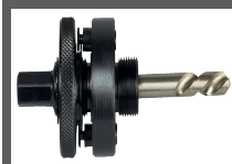
Arbors for bi-metal hole saws standard