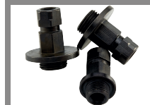
Set of 3 adapters standard hole saw