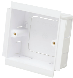
MTSB1, MTSB1-25, MTSB1-50