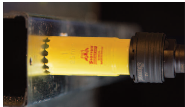
Fast Cut Hole Saw application.