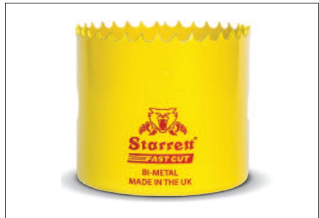
Fast Cut Hole Saw.