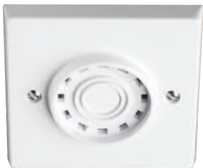
FX003W white flush sounder