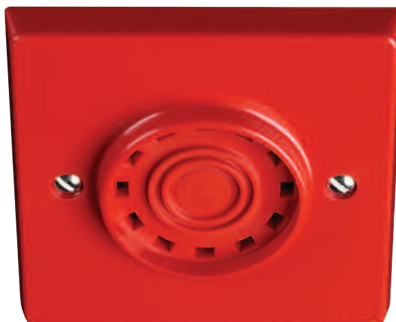
FX003 red flush sounder