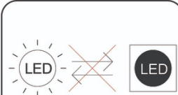
Non-replaceable light source