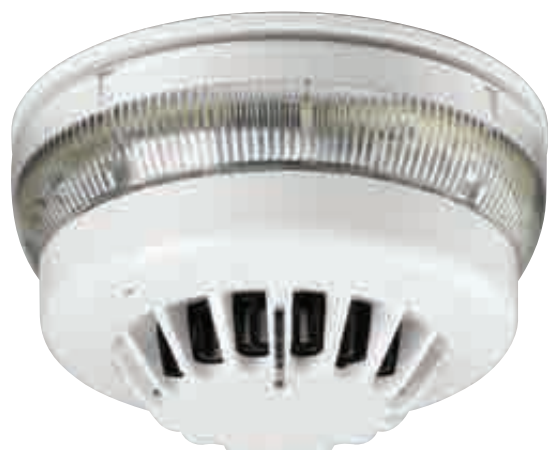
VAD sounder beacon base shown with optical sensor

Optional cover plate can be used to enable the sounder to operate as a dedicated discreet standalone device