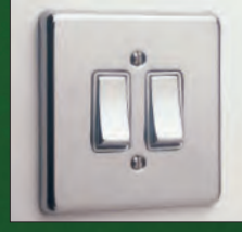
Highly Polished Chrome