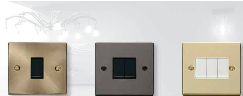
011 (025 intermediate)

e.g. Two way switch next to an intermediate switch (shown above).