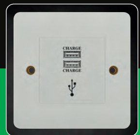
EURO MODULE SOLUTION