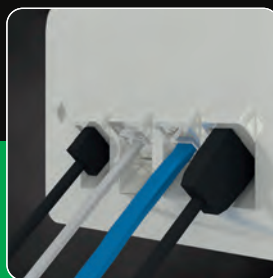
ANGLED KEYSTONE FOR IMPROVED CABLING

Instinct keystone plates are available from 1 to 4 gang as well as a grid assembly and offer a flexible and improved data solution. The plates are compatible with keystone modules that are also supplied with the Instinct range, these include RJ45 up to Cat 7, USB up to 3.0, HDMI, TV, telephone and satellite. The keystone plates have an angled connection point which reduces the risk of cable damage.