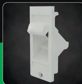
GRID KEYSTONE SOLUTION