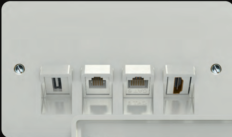
Keystone module solution

Consistent plate depth throughout the range