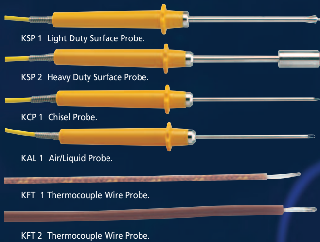
KSP 1 Light Duty Surface Probe.