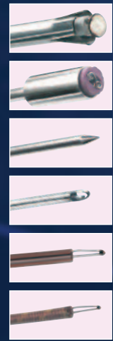
KFT 2 Thermocouple Wire Probe.