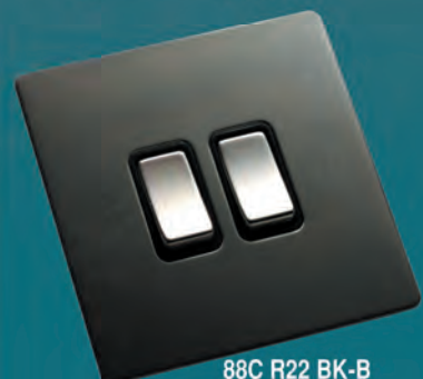
88C R22 BK-B