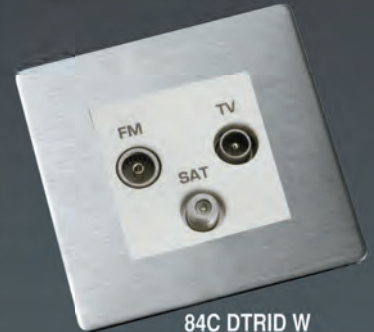
84C DTRID W