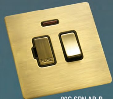
89C SPN AB-B