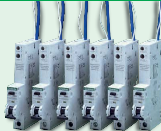
SINGLE MODULE RCBOs