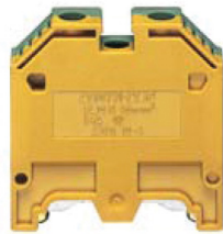
SL 16/35 N