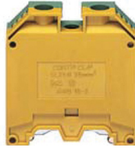
SL 35/35 N