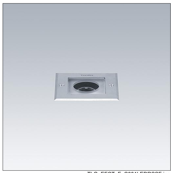
TLG EFCT F C001LEDRSSF.jpg