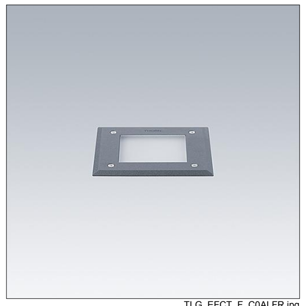
TLG EFCT F COALFR.jpg