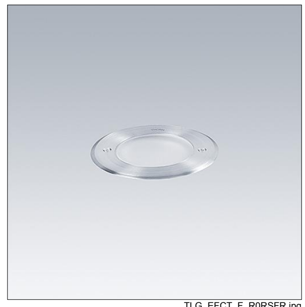
TLG EFCT F RORSFR.jpg