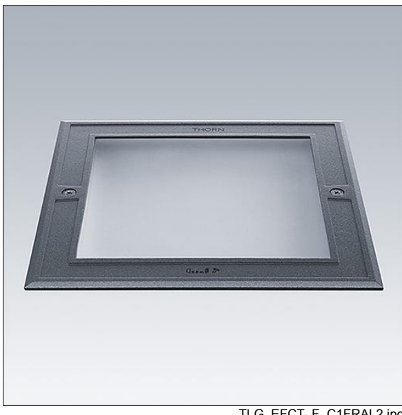
TLG EFCT F C1FRAL2.jpg

Dimensions: 186 x 186 x 202 mm Luminaire input power: 6.3 W Luminaire luminous flux: 64 Im Luminaire efficacy: 10 lm/W Weight: 3.59 kg