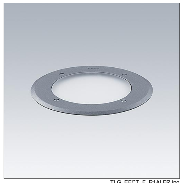
TLG EFCT F R1ALFR.jpg