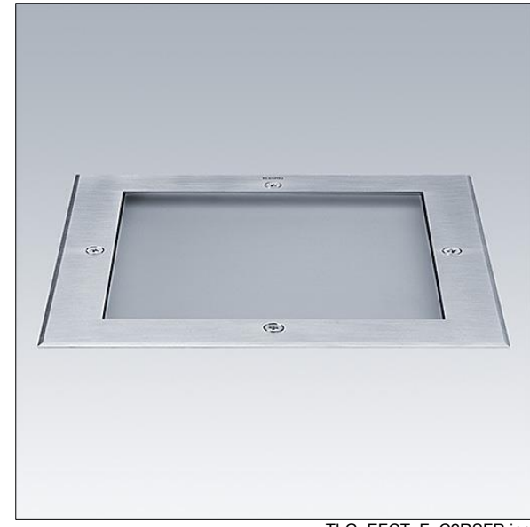
TLG EFCT F C2RSFR.jpg