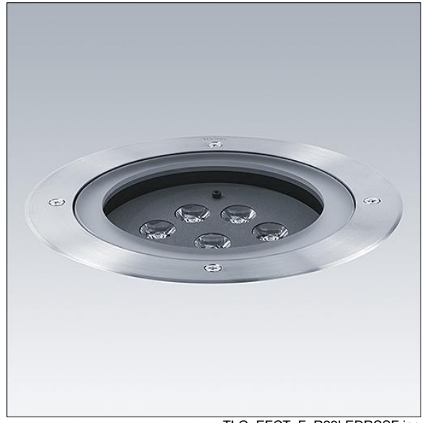
TLG EFCT F R29LEDRSSF.jpg