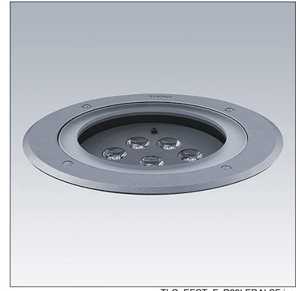
TLG EFCT F R29LEDALSF.jpg