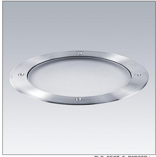
TLG EFCT F R2RSFR.jpg