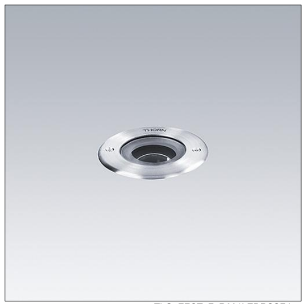
TLG EFCT F R001LEDRSSF.jpg