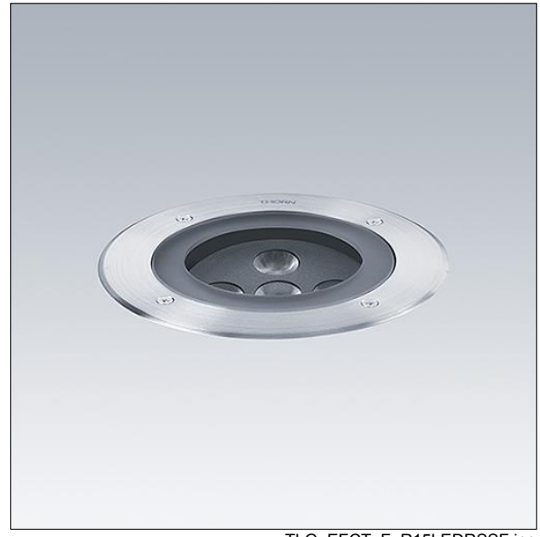
TLG EFCT F R15LEDRSSF.jpg