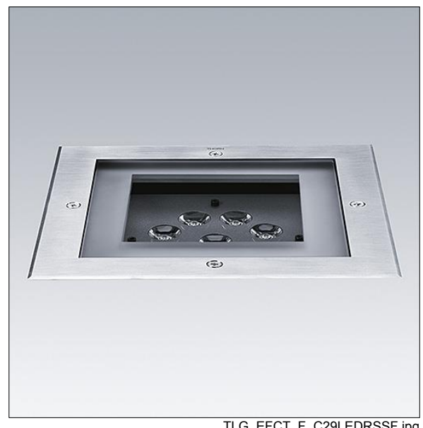
TLG EFCT F C29LEDRSSF.jpg