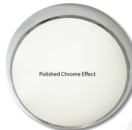
Polished Chrome Effect