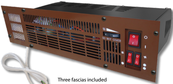
Three fascias included