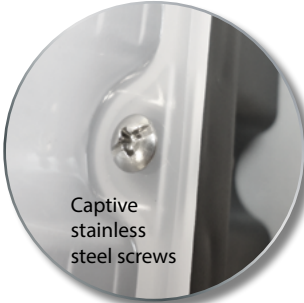
Captive stainless steel screws