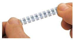
Stretching a WMB marker strip.