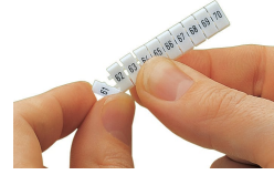
Separating an individual marker from the WMB marker strip – for larger terminal blocks.