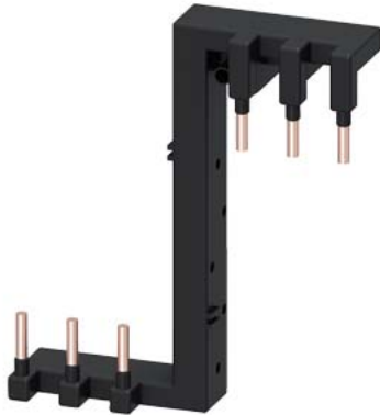
Safety main power connector for series connection of two contactors 3RT202. Size S0 screw terminal