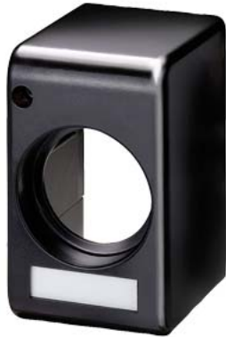
DIAZED molded plastic cap DIII/63A E33