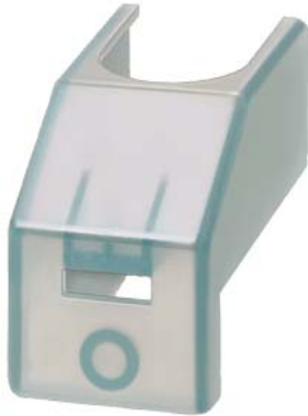
Terminal cover, 1-pole, for 63 A, accessory for main and emergency switching-off switch 3LD2