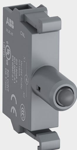
ABB pilot devices are engineered for total reliability. Our products are tested to extremes and proven in the toughest environments. Their innovative designs simplify the entire process, from selection to installation.

The modular LED blocks MLBL are our most versatile range with high level of flexibility and market leading electrical ratings. Engineered for total reliability, longer lifetime, and highest mechanical durability. Self-cleaning contacts ensure reliable operation without the need for maintenance, increasing uptime. High degree of protection guarantee reliability in extreme environments. The innovative design simplifies the entire process, from selection to easy and quick, tool-free installation. The perfect solution for every application.