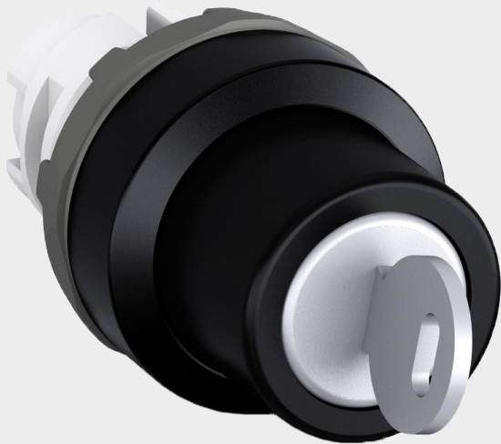
ABB pilot devices are engineered for total reliability. Our products are tested to extremes and proven in the toughest environments. Their innovative designs simplify the entire process, from selection to installation.

Modular key-operated selector switches M2SSK, M3SSK are our most versatile range with high level of flexibility and market leading electrical ratings. Engineered for total reliability, longer lifetime, and highest mechanical durability. Self-cleaning contacts ensure reliable operation without the need for maintenance, increasing uptime. High degree of protection guarantee reliability in extreme environments. The innovative design simplifies the entire process, from selection to easy and quick, tool-free installation. The perfect solution for every application.